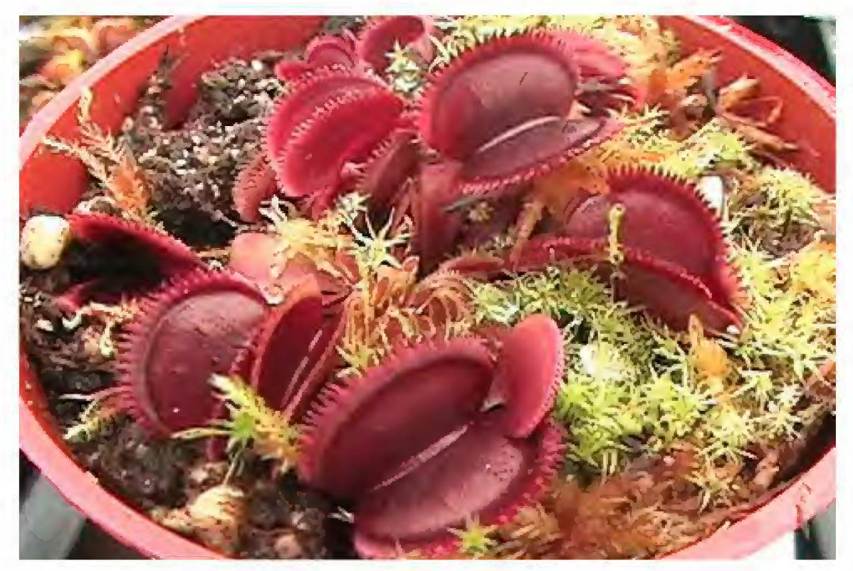
Figure 3: Dionaea 'Scarlet Bristle' plant.

This cultivar was first discovered in the spring of 2006 while performing a replate of typical Dionaea tissue cultures. One small clump of plants caught my interest as it exhibited much red coloration to the trap lobes which was a contradiction to the uniform green that was always observed with that particular form of Dionaea under lab conditions. Upon closer inspection it was also noted that the marginal cilia on the traps was short and jagged in contrast to the cilia of other plantlets in the culture. As these particular Dionaea cultures had been maintained over the course of a few years on a basic 1/2 MS medium with no added PGR's one can only conjecture that the mutation developed through the multiple divisions that took place over that time. With great interest the specimen was isolated and propagated in sterile culture, planted out and hardened under artificial lighting followed